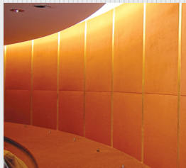
Deerfield Academy Auditorium, Boston.

NOTE: For product's Approvals and Ratings, Technical Specifications and Standards Compliance - Please refer to Page - 16 and 17.