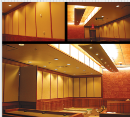
Moot Court Room at University of Nevada Las Vegas (UNLV) - Las Vegas.